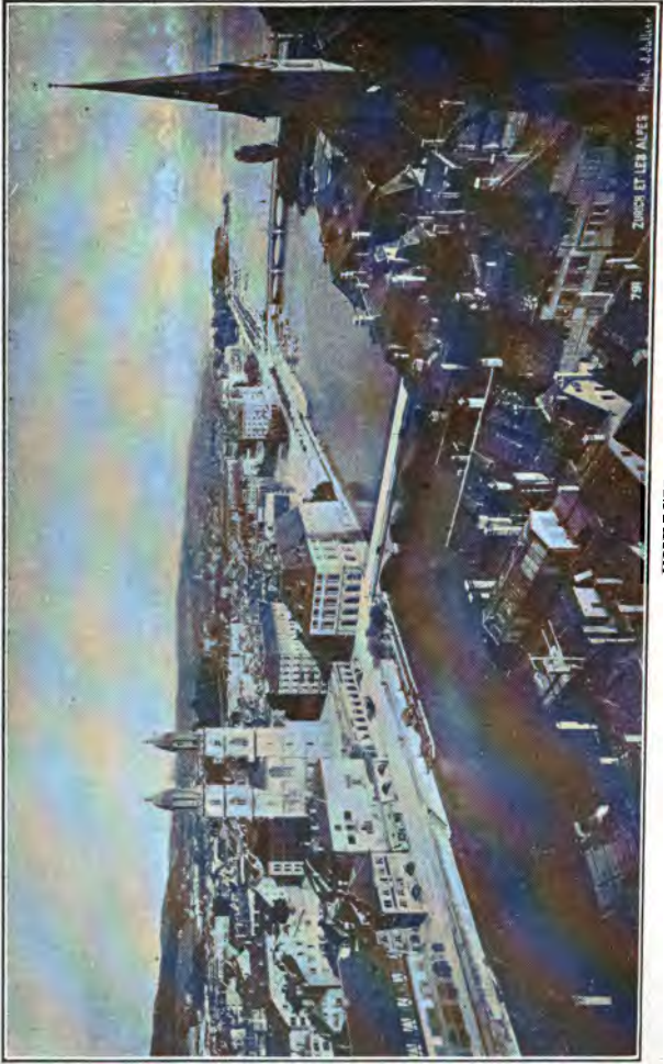
ZURICH The Two-Towered Church is the Cathedral.